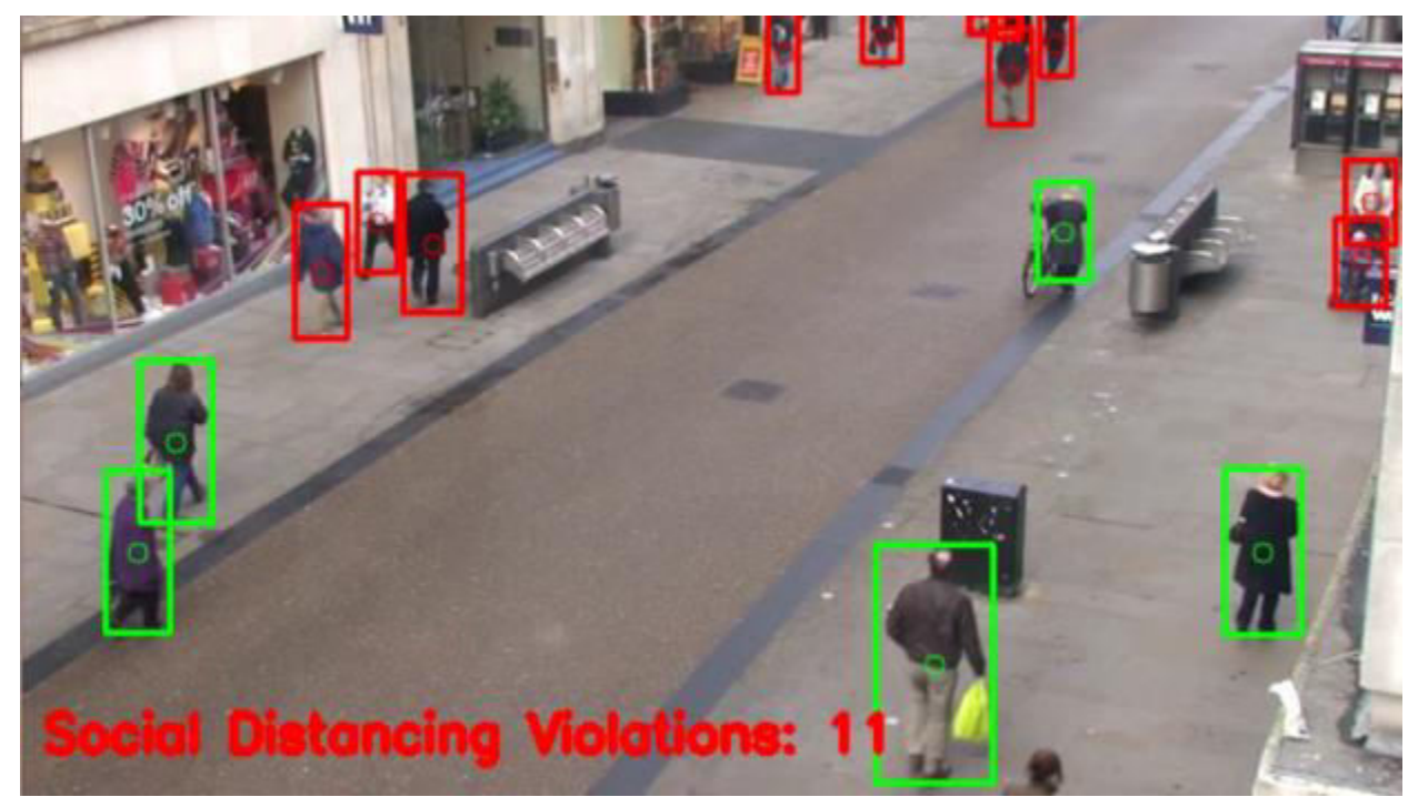
Fig -5: The Stage 2 Detection with Warning Notification