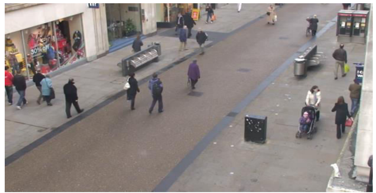
Fig -3: The Video Input

For the sake of illustration, I've included some screenshots from the actual functioning programme model. Two phases are involved. First, the video is used to count the number of pedestrians, and the total number of pedestrians is presented in the bottom right corner. The warning notice that appears in the lower right corner of the screen was introduced in the second stage.