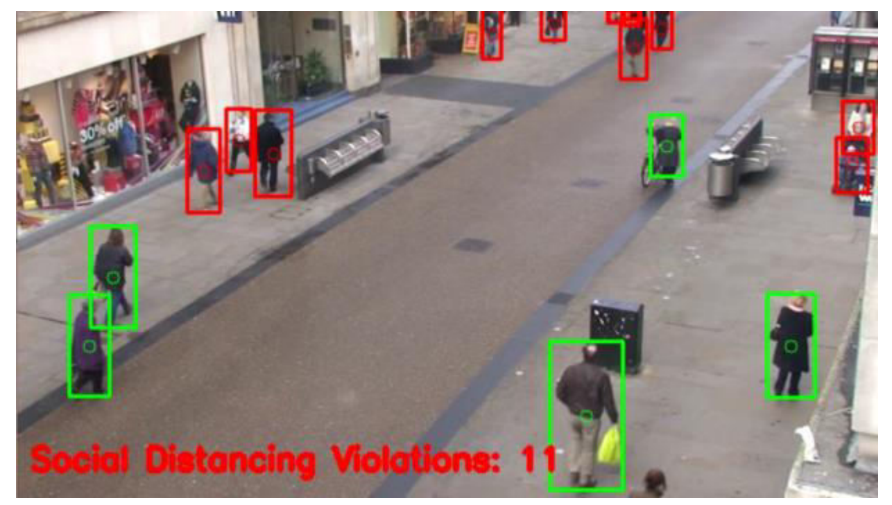
Fig -4: The Stage 1 Detection

||Volume 11, Issue 5, May 2022|| | DOI:10.15680/IJIRSET.2022.1105199 |